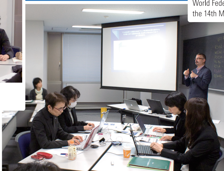
Captioning Group, "Ubiquitous"