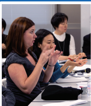
Australian Sign Language → English → Japanese

Funded by a grant from the Scientific Research Program (Creative Scientific Research), the Japan Society for the Promotion of Science